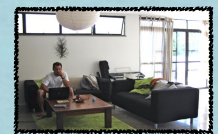
OUR NEW HOME The dining room, kitchen, living room and the guest room all ready for our family and friends. We are so grateful how God has provided. Praise the Lord!